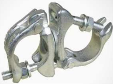
Forged Swivel Coupler