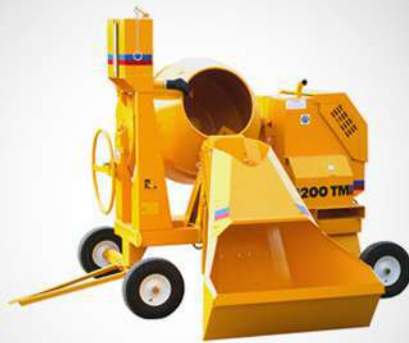
Concrete Mixer With Hopper