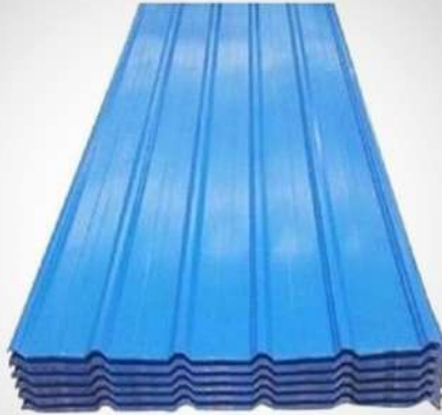
GI Corrugated Roofing Sheet