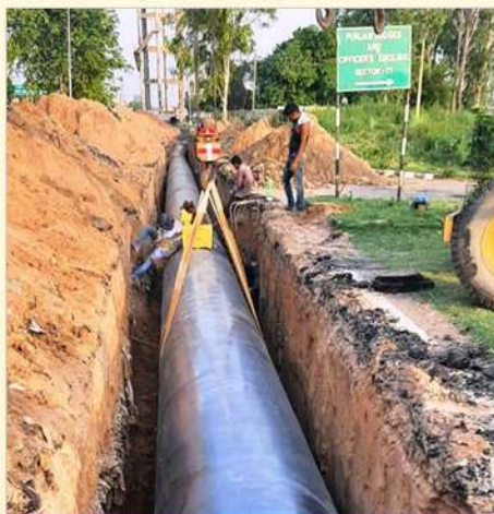
MS pipe Laying