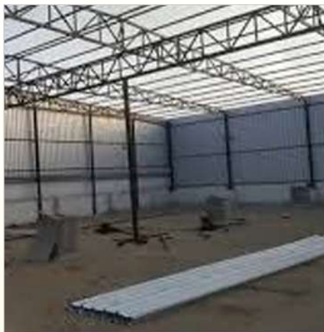
Steel Structure Work