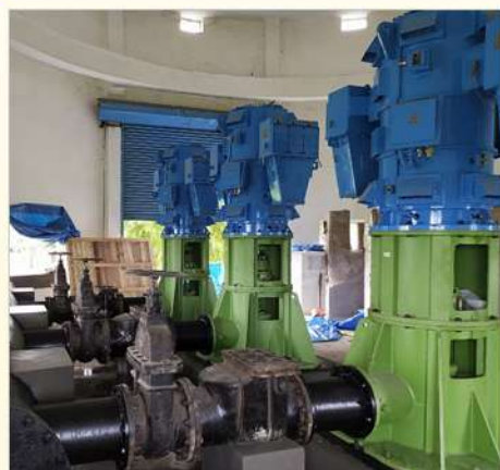
Equipment Erection work