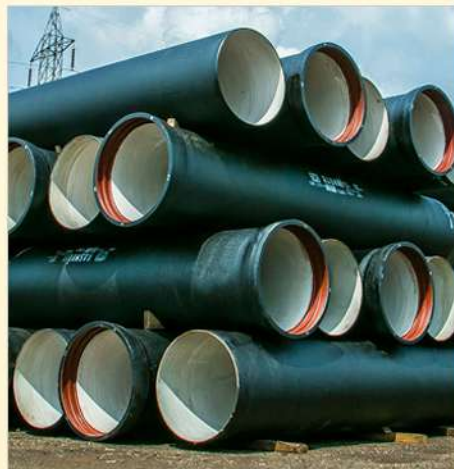
DI Pipes & Fittings