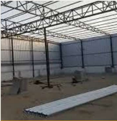
Steel Structure Work