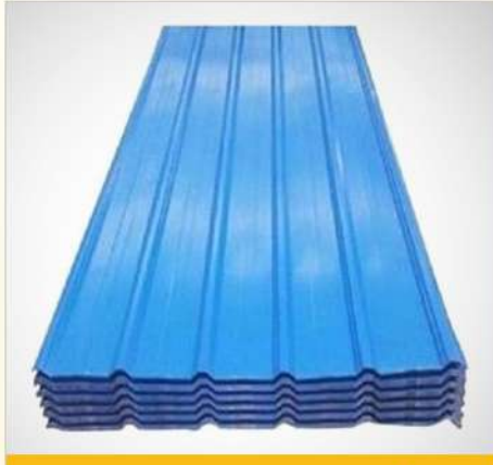
GI Corrugated Roofing Sheet