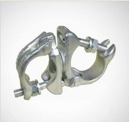
Forged Swivel Coupler