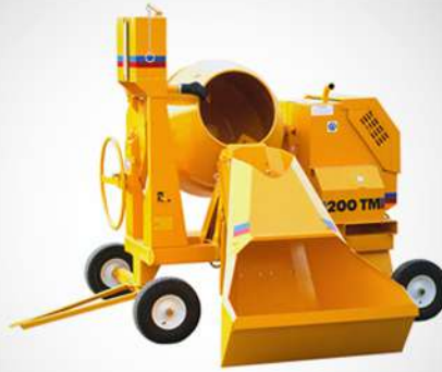
Concrete Mixer With Hopper