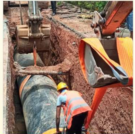
DI Pipe Laying