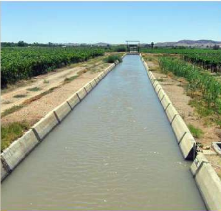
Storm Water Drainage