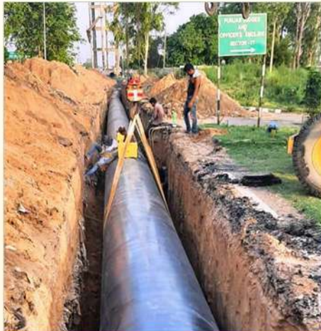
MS pipe Laying