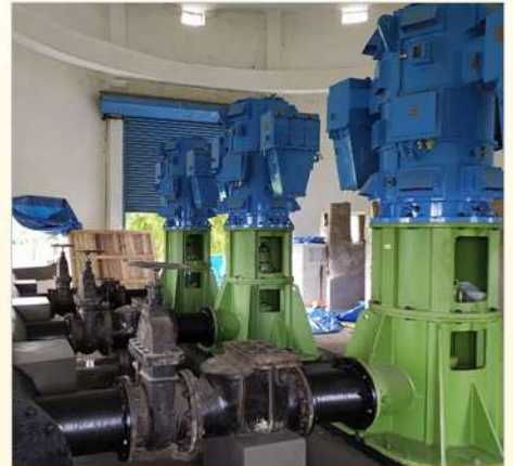
Equipment Erection work